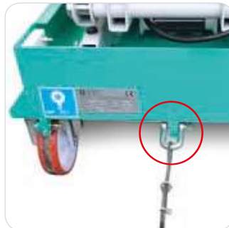
Winching eye for easy transport.