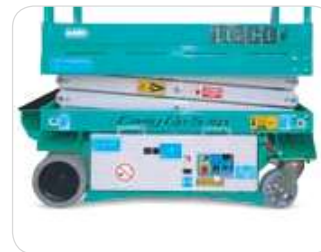
Pothole protection steel shoes welded nearby the wheels.