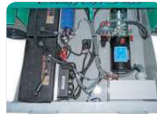
Proper and ergonomic components disposition for easier and faster maintenance task.