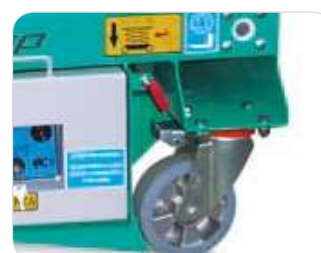
Swivel caster interlock for straight line driving.