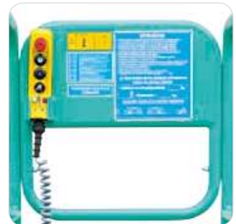
Removable control allows for easy and safe movement. Equipped with key switch and emergency stop button.