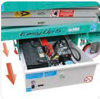
All the component parts are easily accessible for servicing.