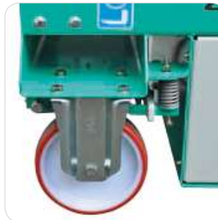
Auto braking on castors.