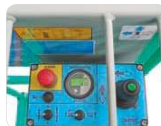
Sturdy IP65, simple and intuitive control box.