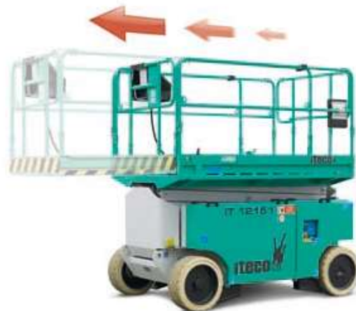
Manual deck extension 1.4 m