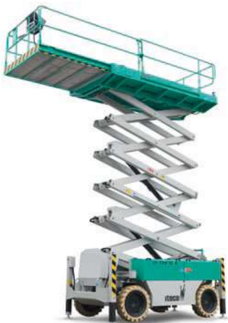
Automatic hydraulic levelling outriggers