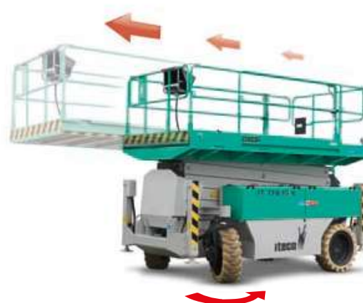
Hydraulic deck extension 2 m