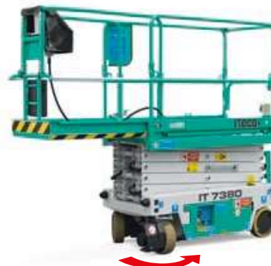
Manual deck extension 1.0 m