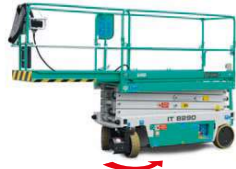
Manual deck extension 1.4 m