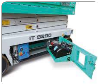
All the component parts are easily accessible for servicing.