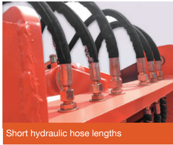
Short hydraulic hose lengths