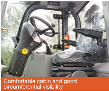
Comfortable cabin and good circumferential visibility