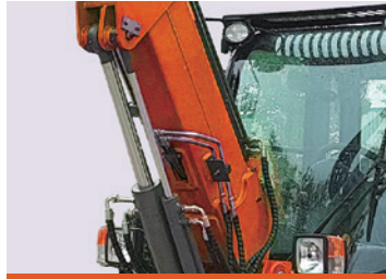
Two bigger and stronger lift cylinder