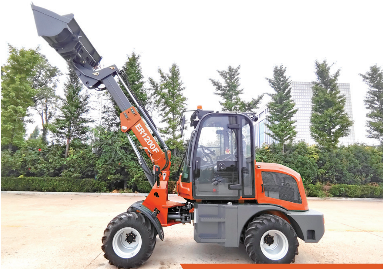
Telescopic Wheel Loader