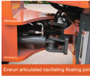
Everun articulated oscillating floating joint