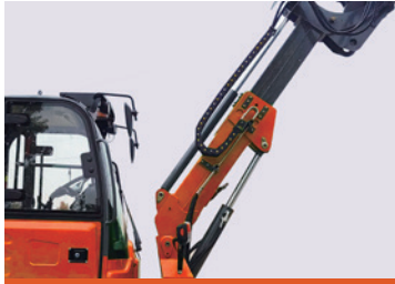
Sturdy telescopic arm