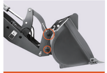
Quick and easy tool change